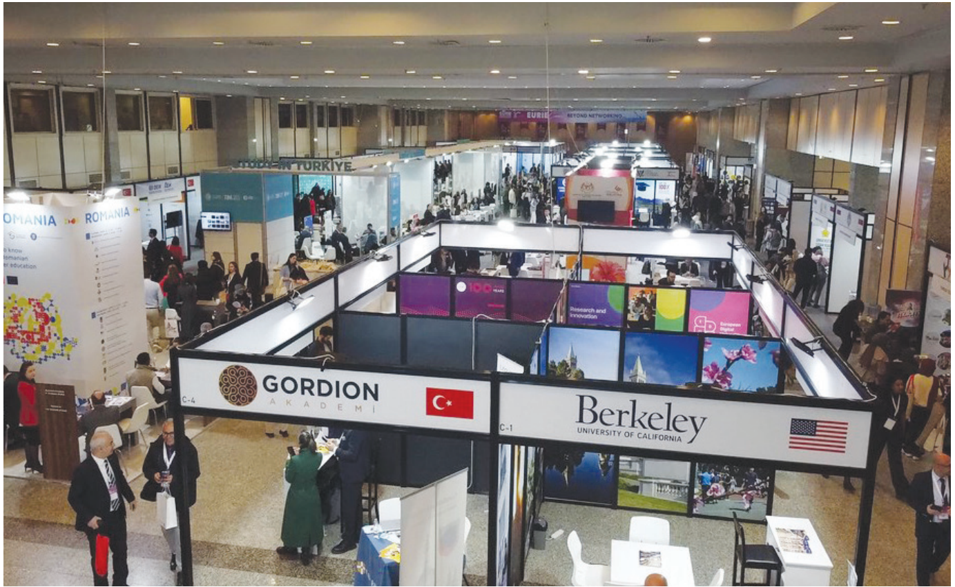
EURIE 2025 Exhibition Hall