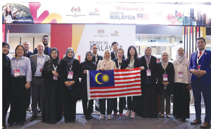
EURIE 2025 Exhibition Hall