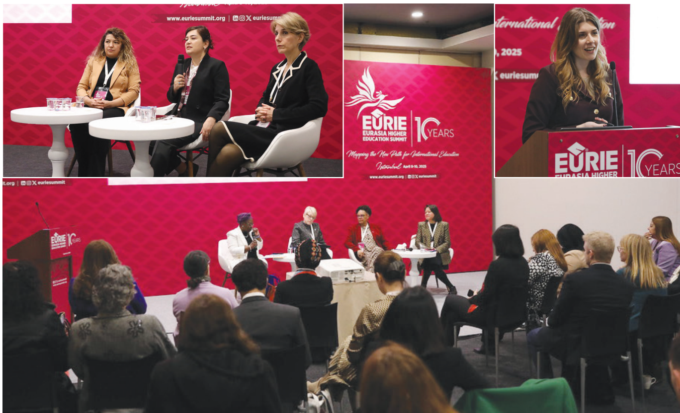
EURIE 2025 Panels