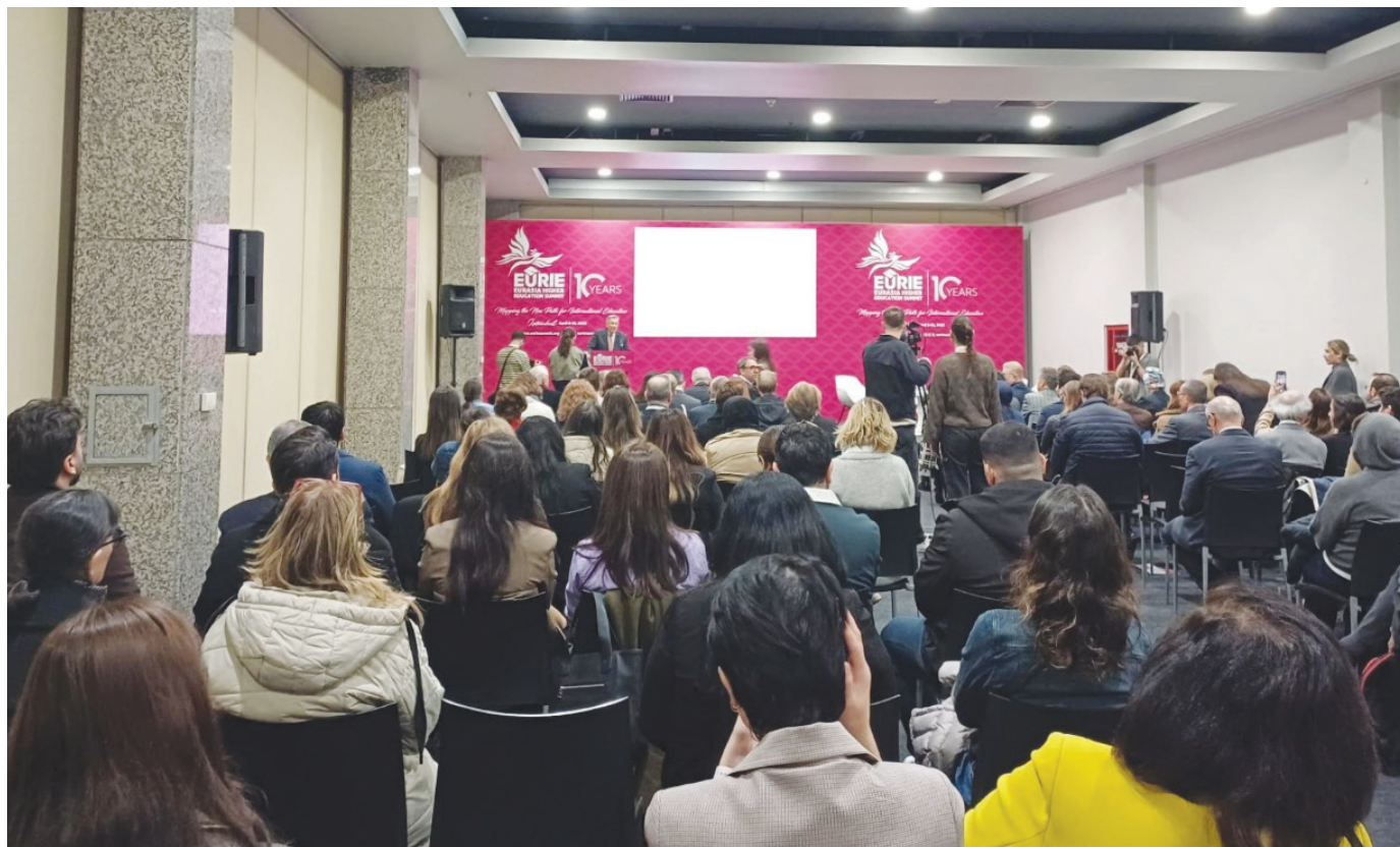
EURIE 2025 Panels