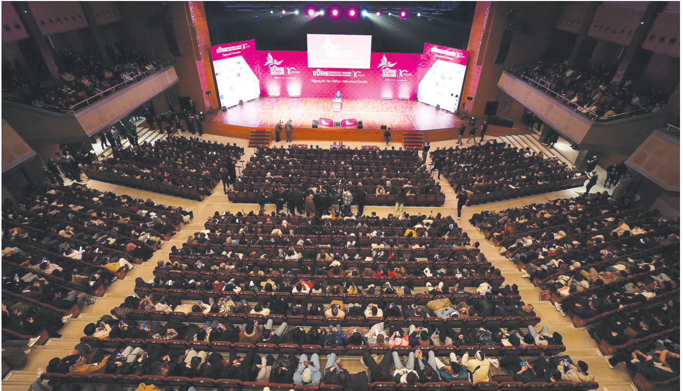
EURIE 2025 Opening Ceremony