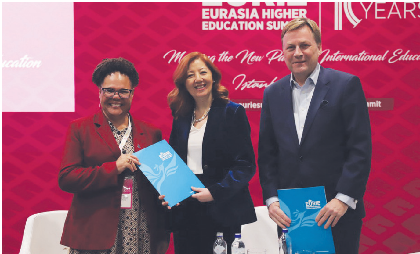
EURIE 2025 Panels