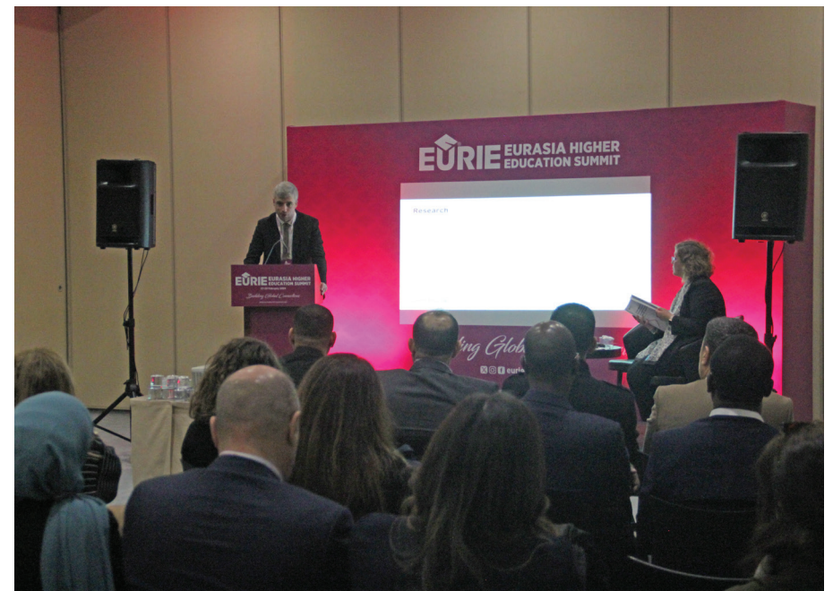
Panel: The Road to Partnerships with Turkish Higher Education Institutions