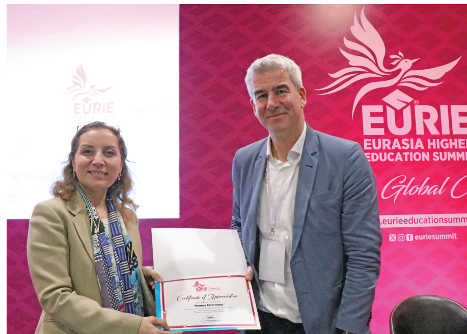
Panel: University Leadership Challenges: The European Perspective