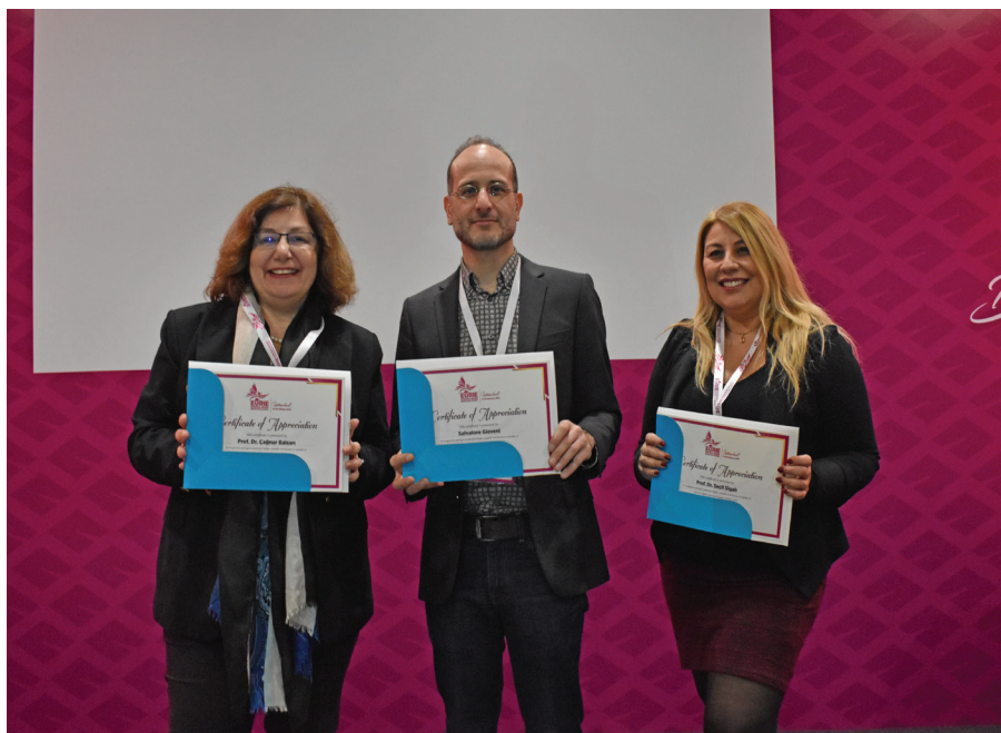
Panel: Erasmus+ KA220 Cooperation Partnerships in Higher Education Projects