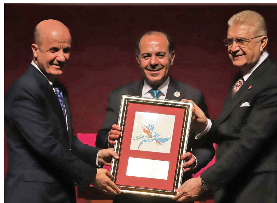
EURIE 2024 Opening Ceremony