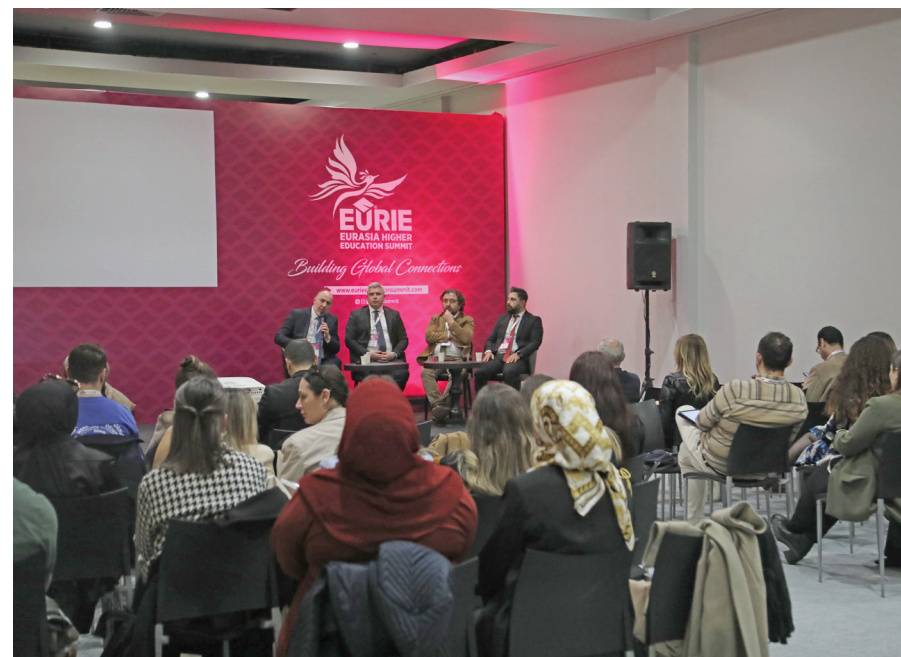
Panel: TÖMER Centers Teaching of Turkish As a Foreign Language