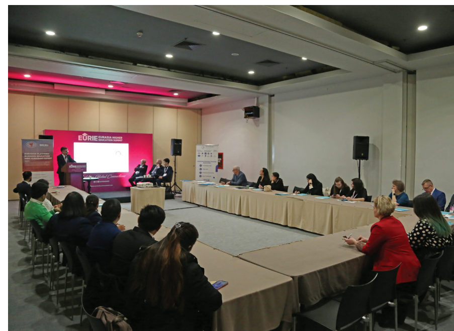
Roundtable: Business Education in Eurasia