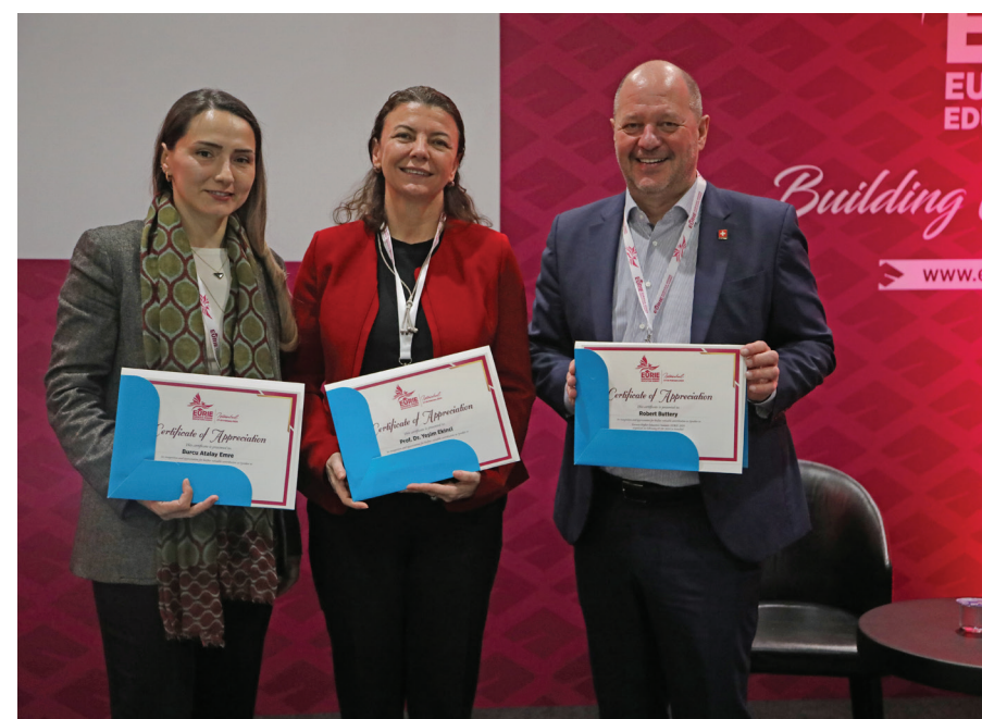
Panel: Erasmus Student Mobility: Dimensions of Sustainability, Equity and Inclusion