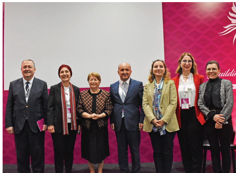
Panel: Vocational Education in Turkish Higher Education: International Standards and Impact on Employability