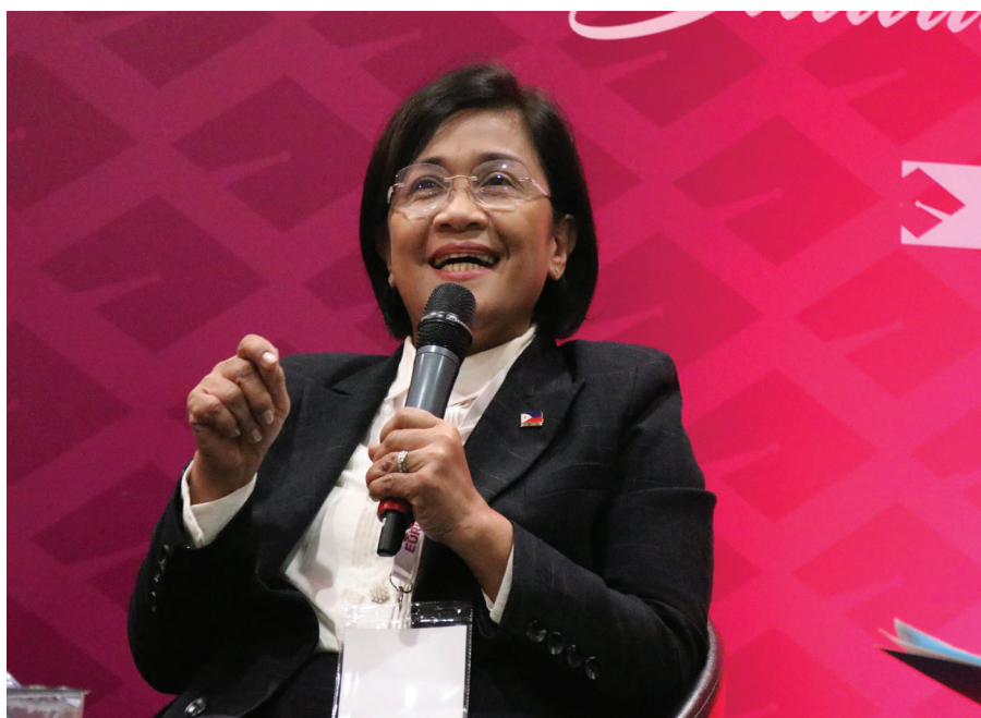
Panel: University Presidents