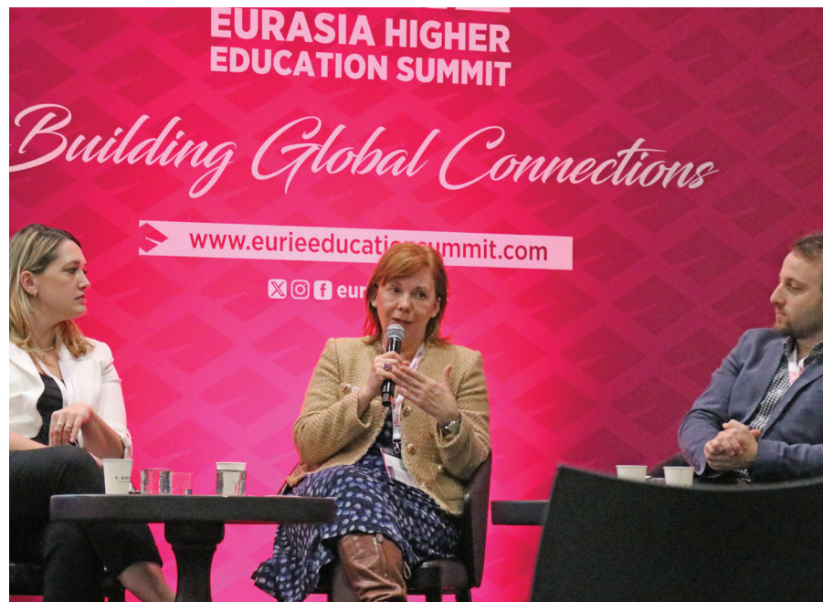
Panel: Navigating New Horizons: The Power of Data in Driving Erasmus Promotion