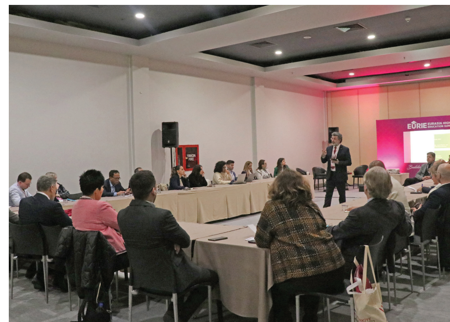
Workshop: The Role of Quality Assurance and Accreditation in the Internationalization of Higher Education Institutions