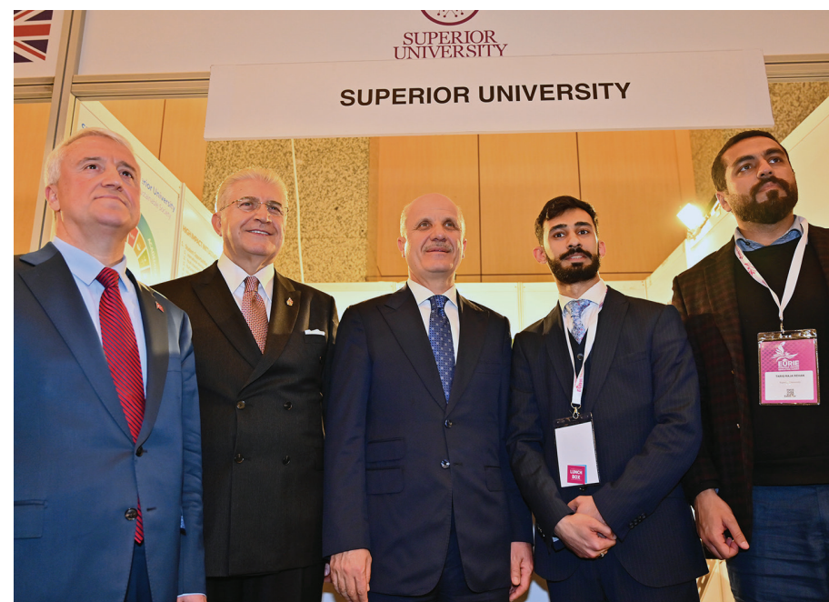
Meetings at the Exhibition Hall