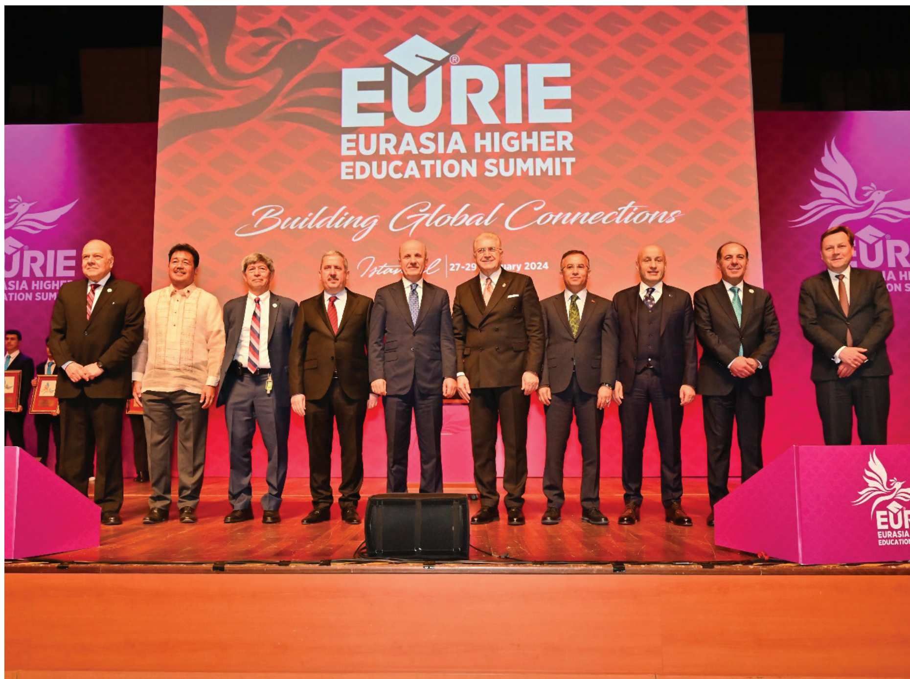
EURIE 2024 Opening Ceremony