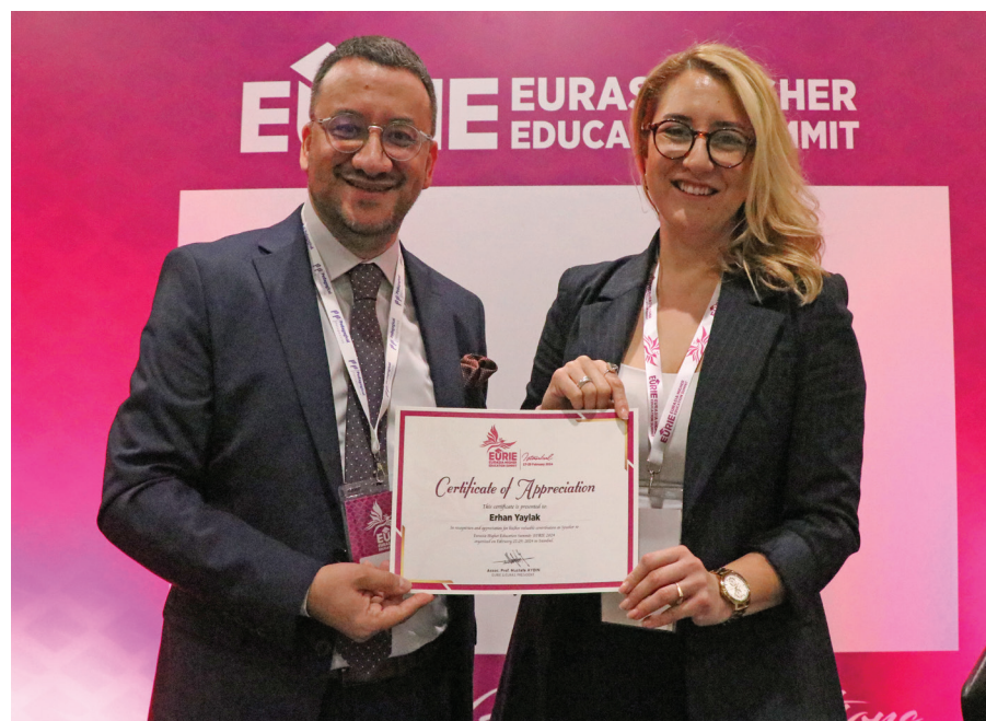
Panel: TSTT 2023: Rethinking How We Train Teachers of Tomorrow