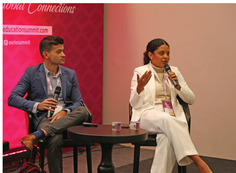
Panel: Creating Bridges: International Student Mobility and Practical Experiences from the Global South and North