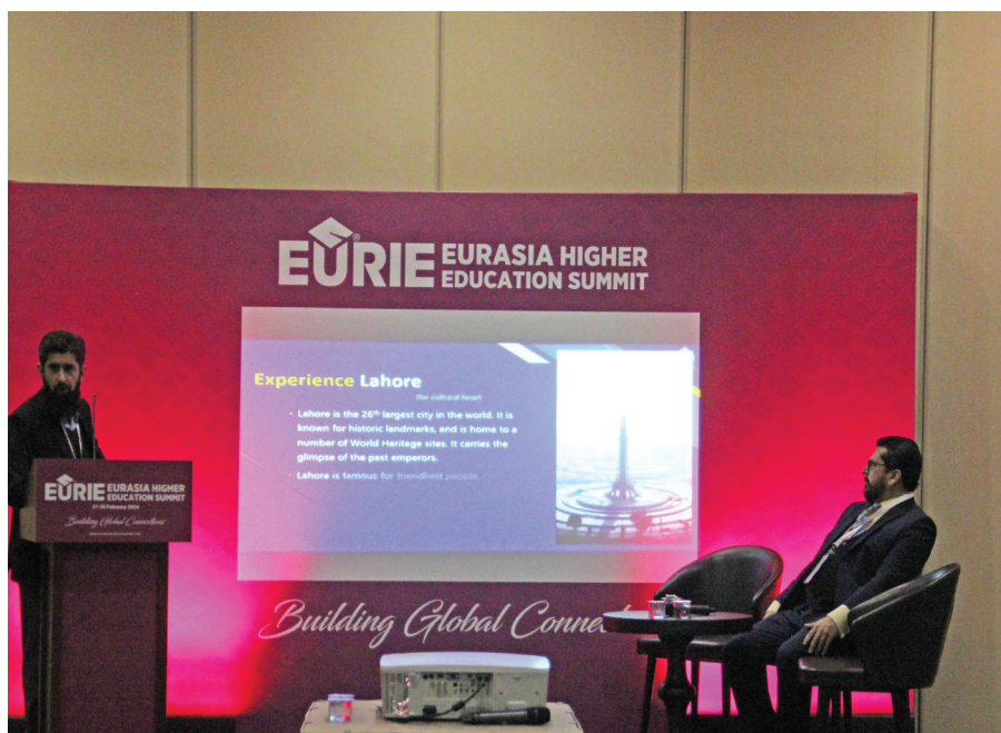
Panel: The Role of Data and Technology in International Education