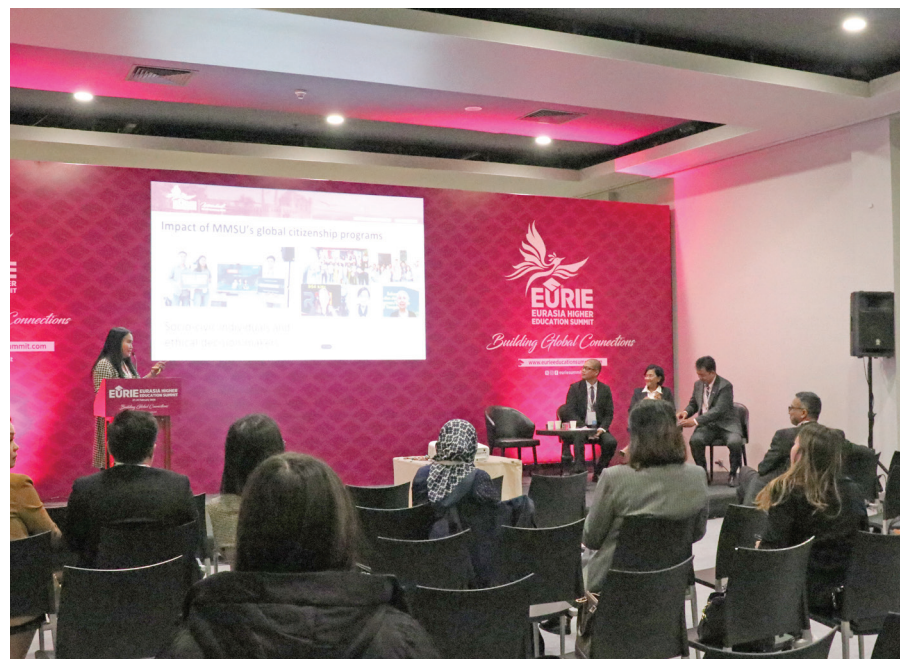
Panel: Innovating Internationalization to Build Global Citizens in the Philippines