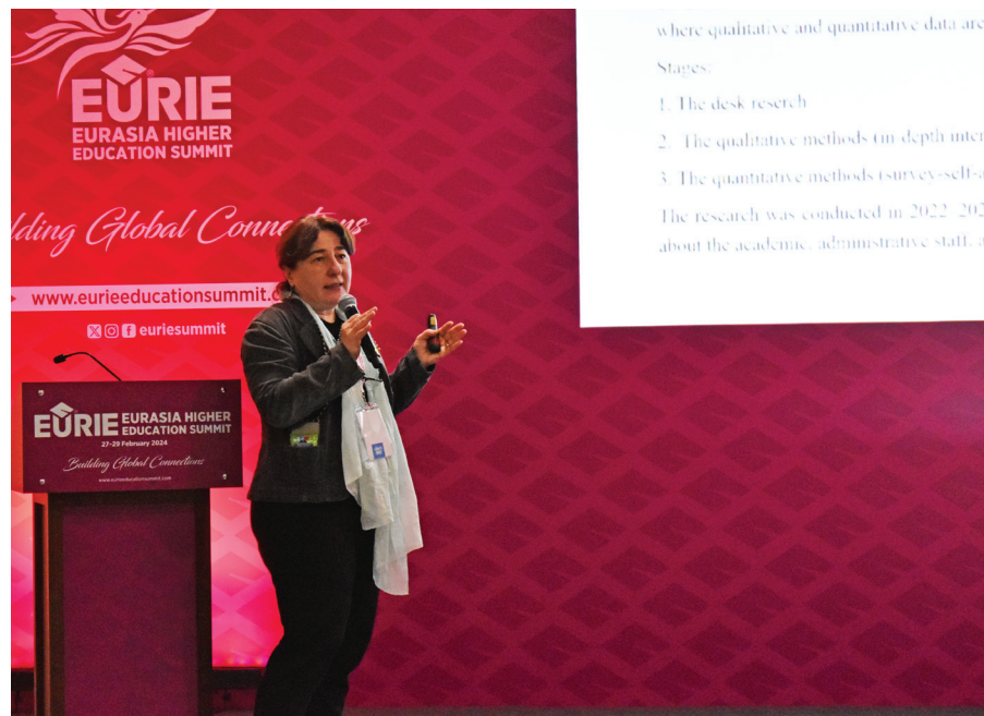
Panel: Impact of Mobility on Students' Values