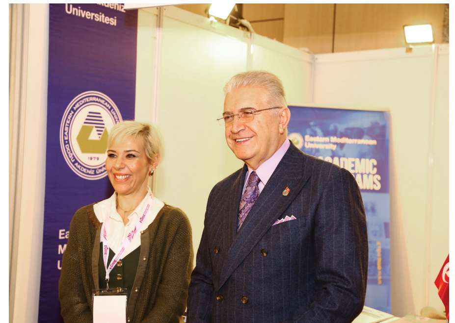
Meetings at the Exhibition Hall