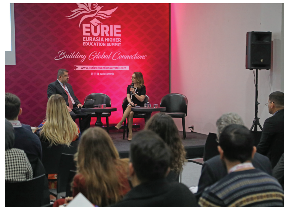
Panel: Impact Rankings