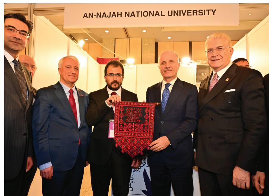
Meetings at the Exhibition Hall