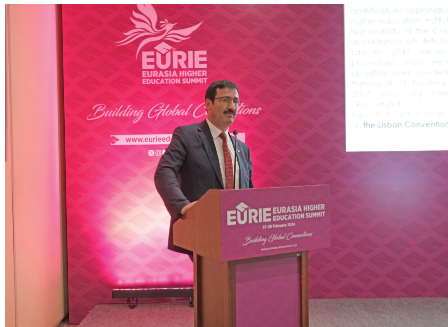
Panel organized by Council of Higher Education: Higher Education in Türkiye