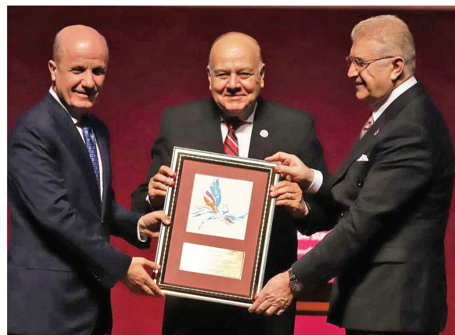
EURIE 2024 Opening Ceremony