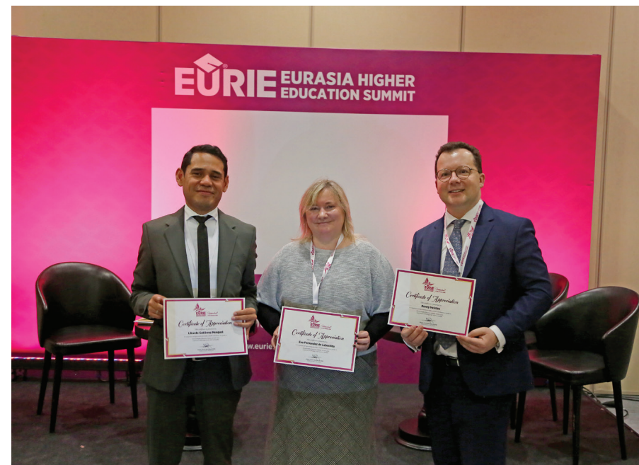
Panel: How to Demonstrate Excellence in Internationalization?