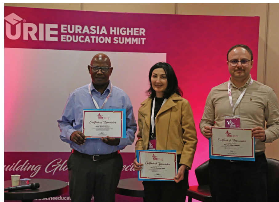
Panel: Research on International Student Mobility