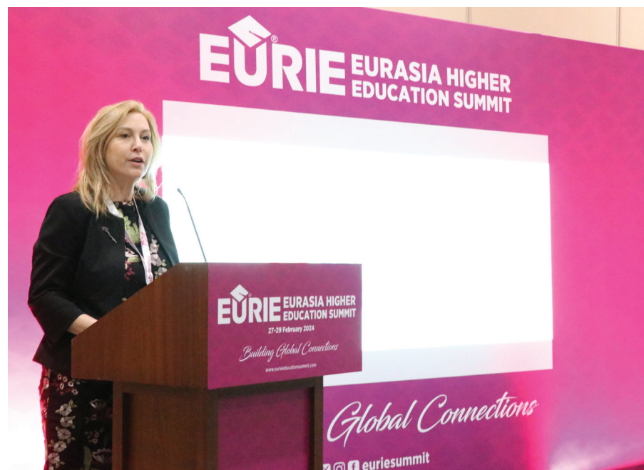
Panel: Equity and Inclusion in International Education