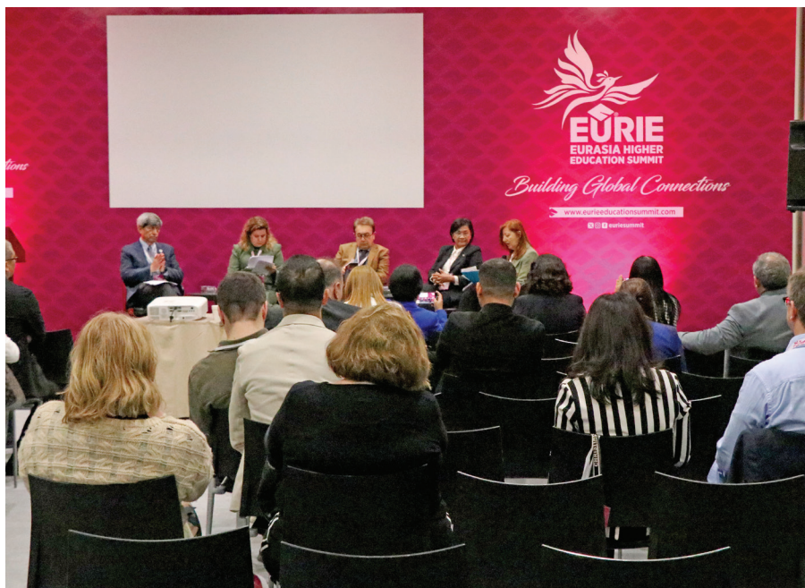
University Presidents' Panel: Current Issues and Challenges in Higher Education