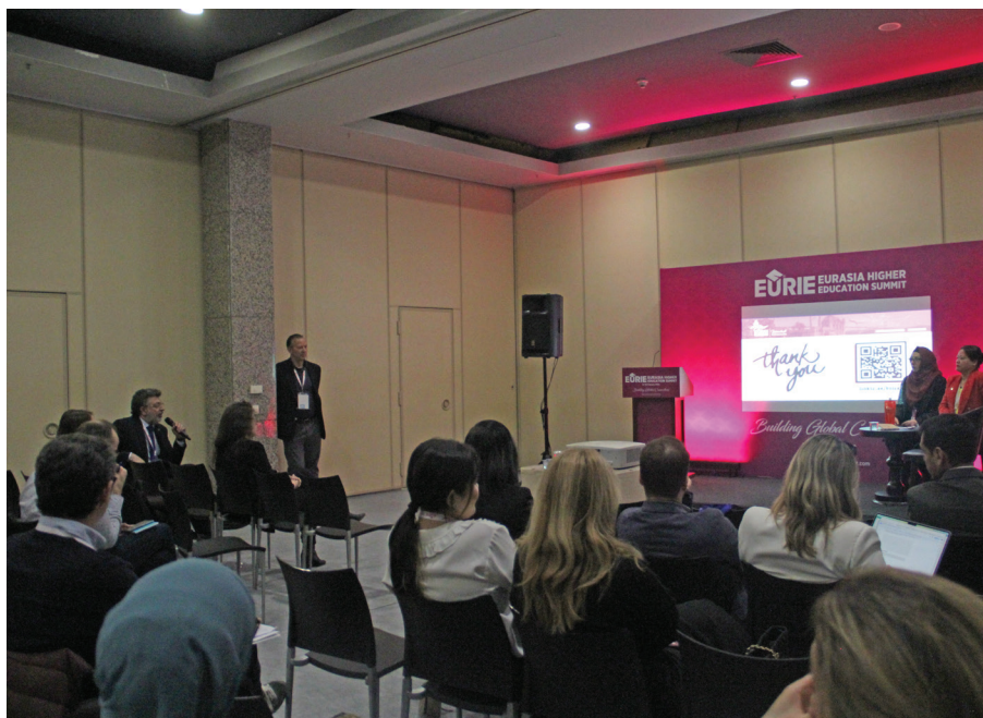
Panel: International Student Experience