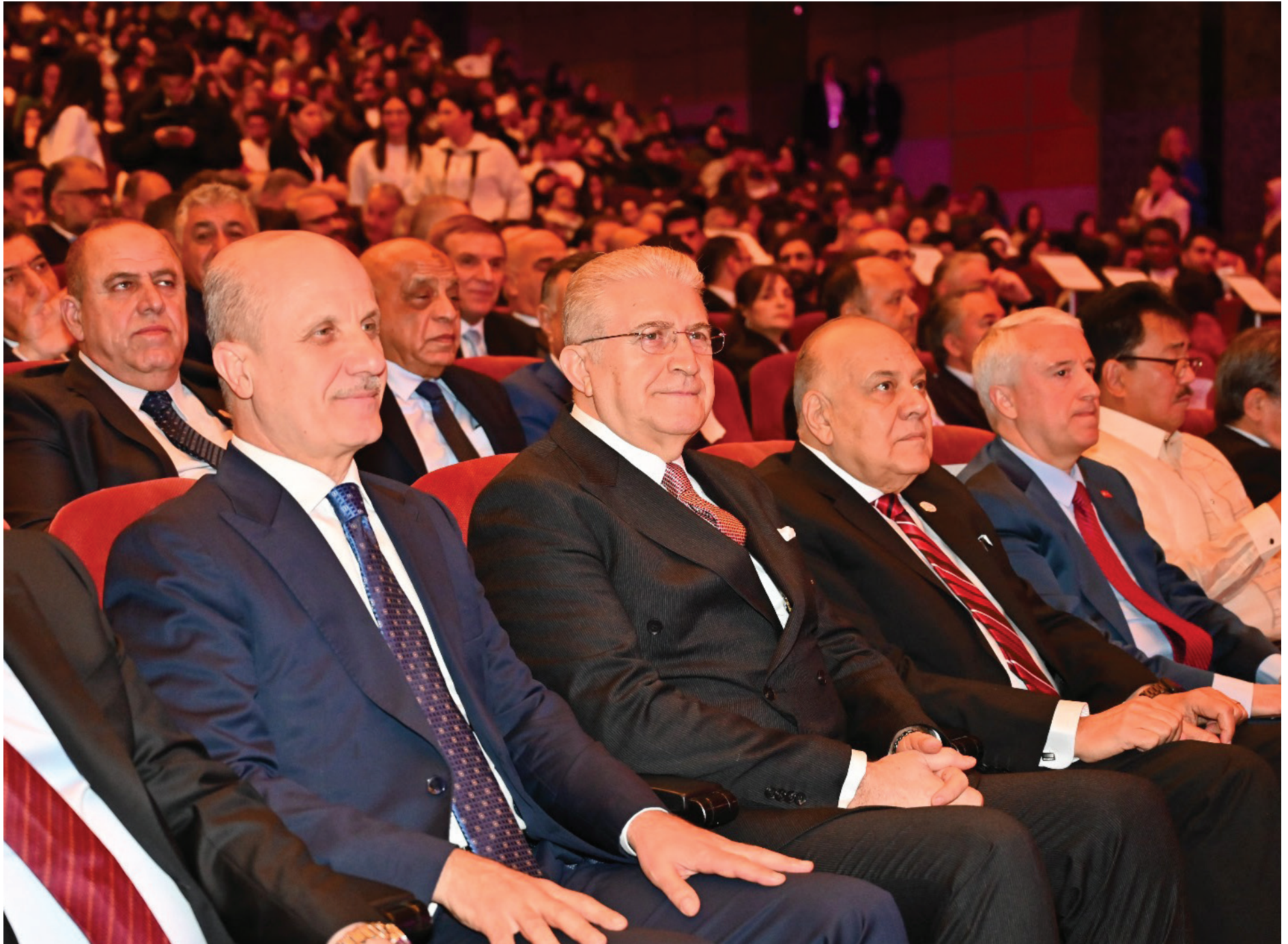
EURIE 2024 Opening Ceremony