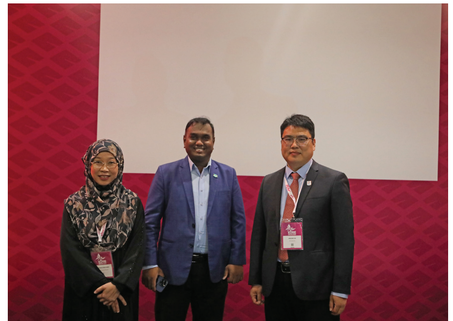
Panel: Global Engagement with Asia