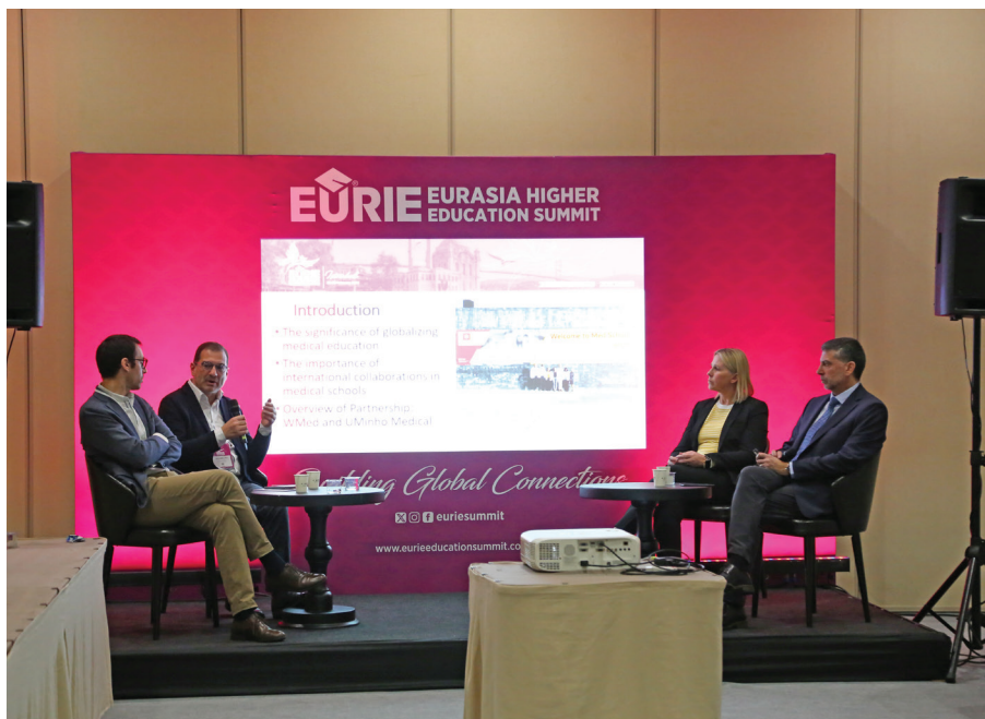
Panel: Global Education Transformation in Medical Training: A Journey from Local to Global Impact