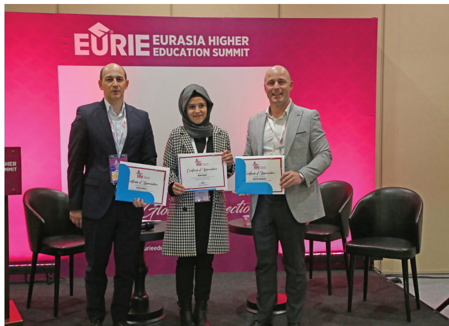
Panel: Boosting Universities' 3rd Mission: Societal Impact and Sustainable Development: French and Turkish examples