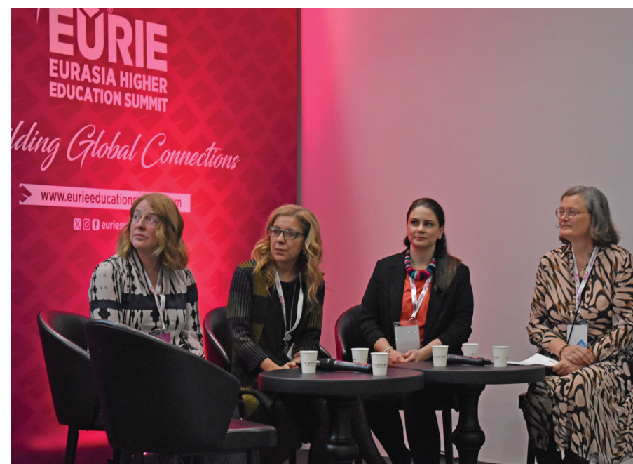
Panel: Erasmus+ KA220 Cooperation Partnerships in Higher Education Projects