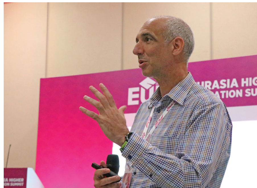
Panel: Capacity Building Projects