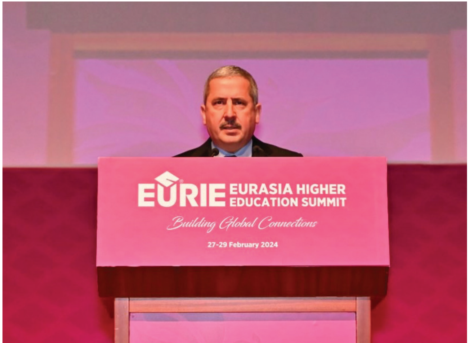
Mahmut Gürcan, Turkish Deputy Minister of Trade