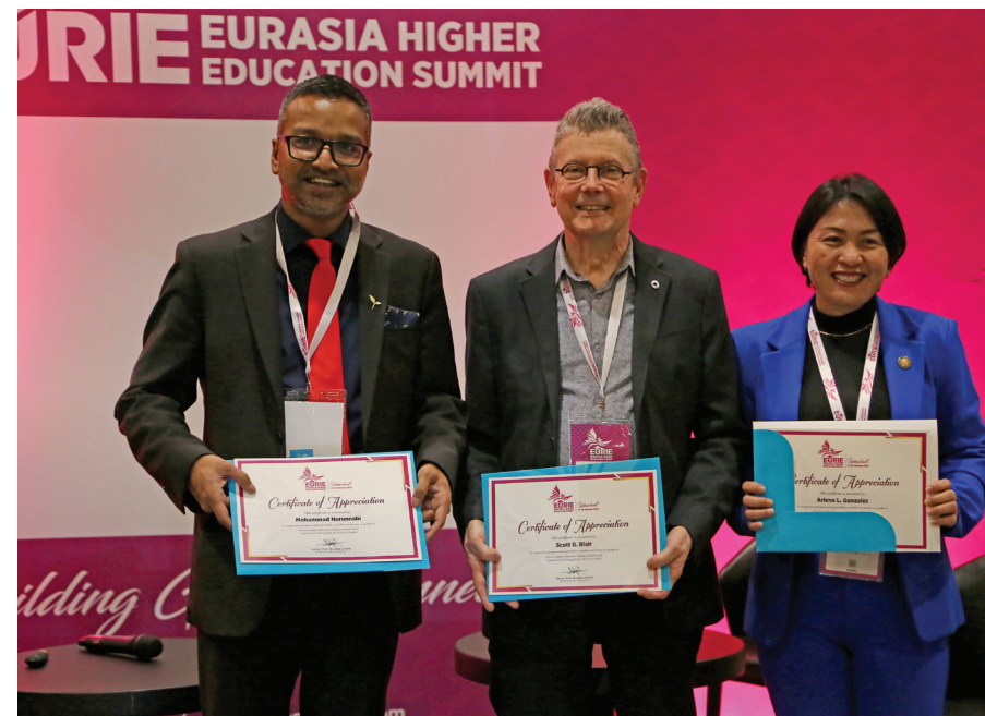
Panel: Sustainability in Higher Education