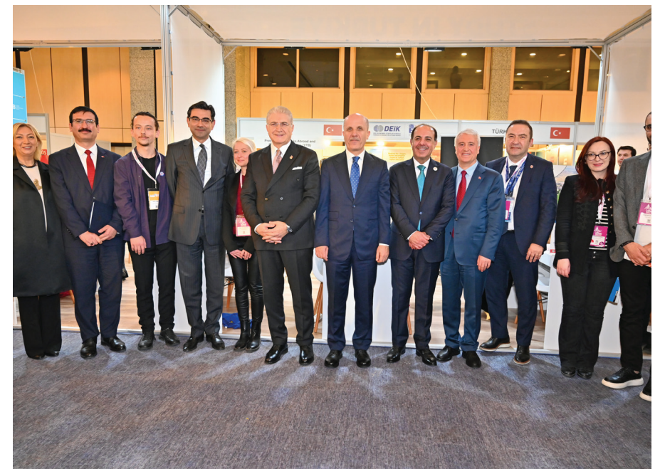
Meetings at the Exhibition Hall