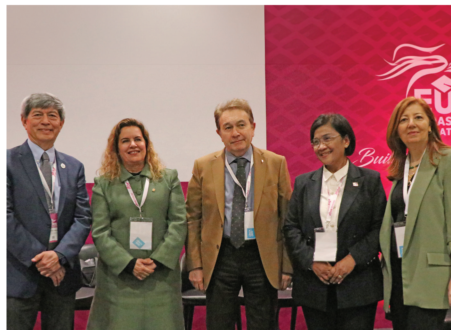
Panel: University Presidents