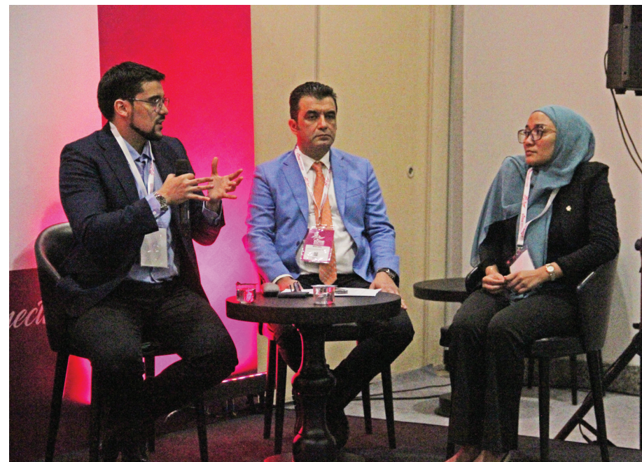
Panel: AI Technology in Higher Education