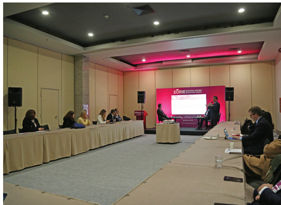
Panel: Global Hubs: Expanding Internationalization through Partnership Cluster