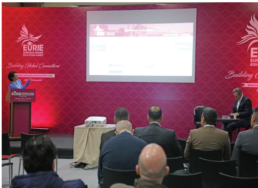
Panel: Role of Data and Technology in International Education