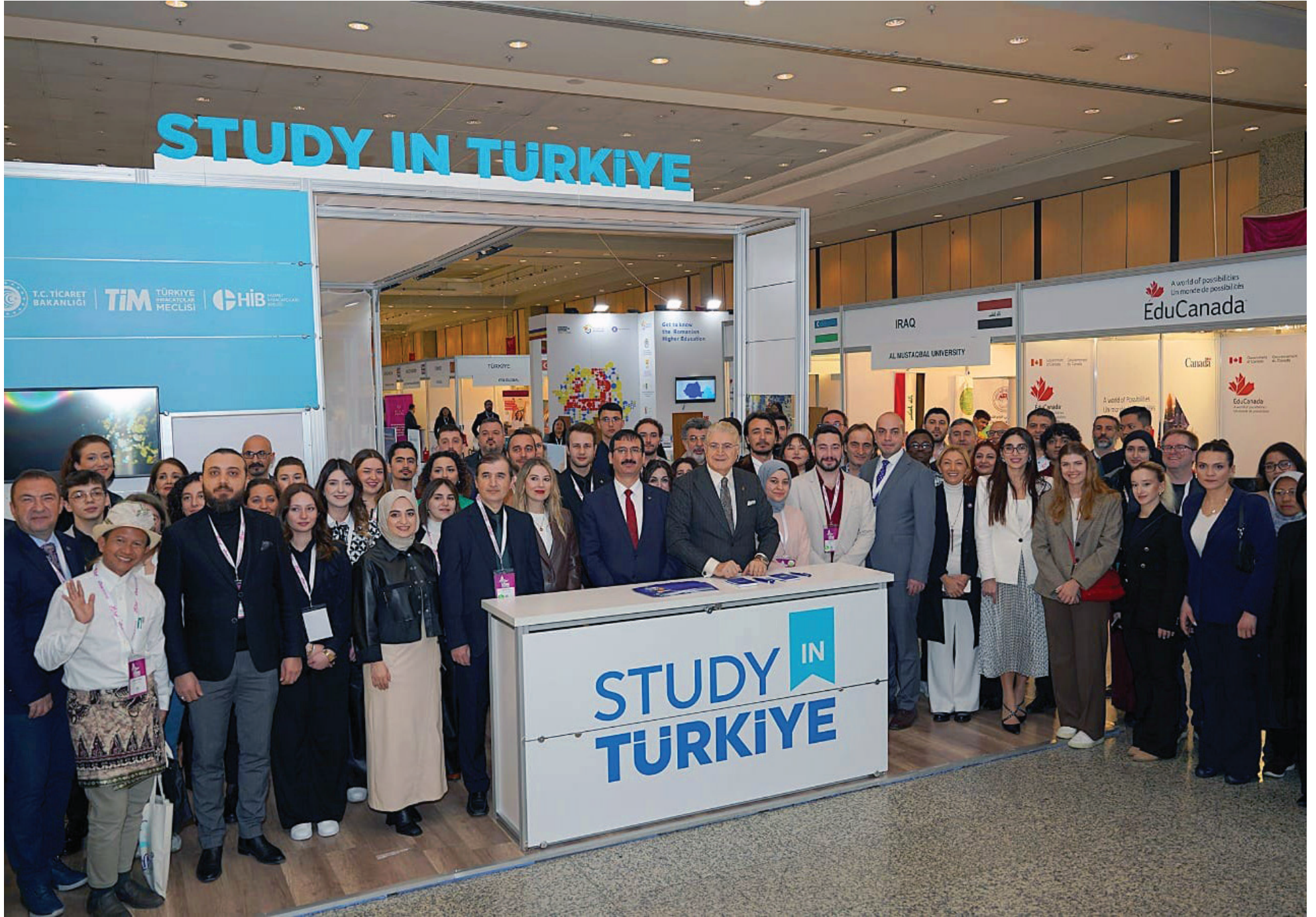
Study in Türkiye Pavilion