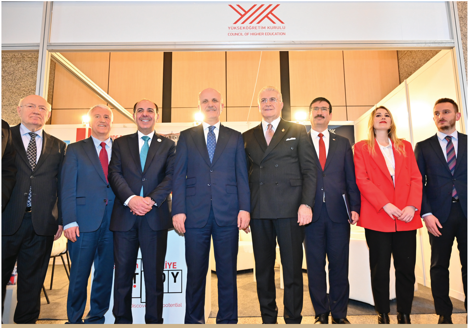
Meetings at the Exhibition Hall