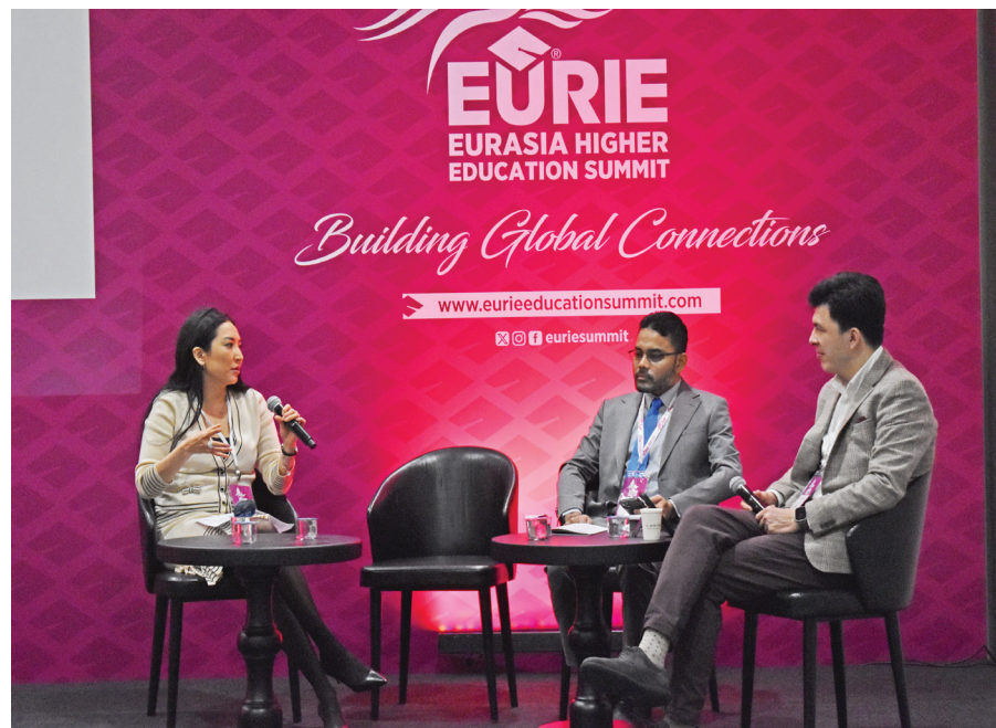
Panel: Lifelong Learning Education and Training