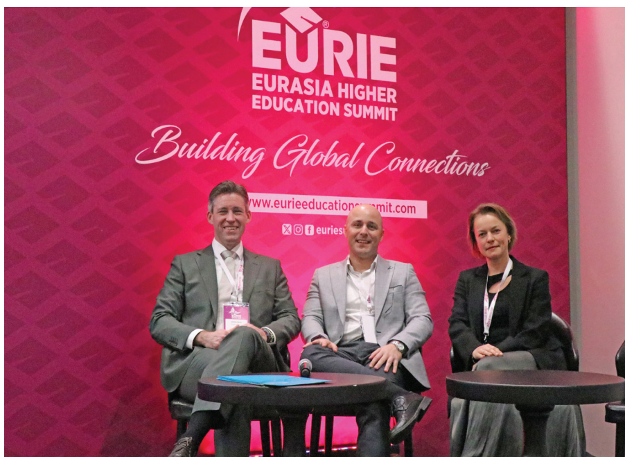
Panel: Bridging Borders with Education: The Power of Transnational Learning