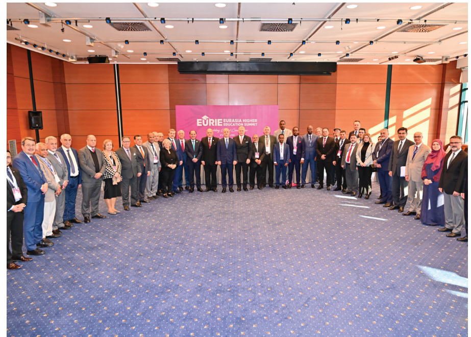
The Fourth Turkish-Arab Congress on Higher Education