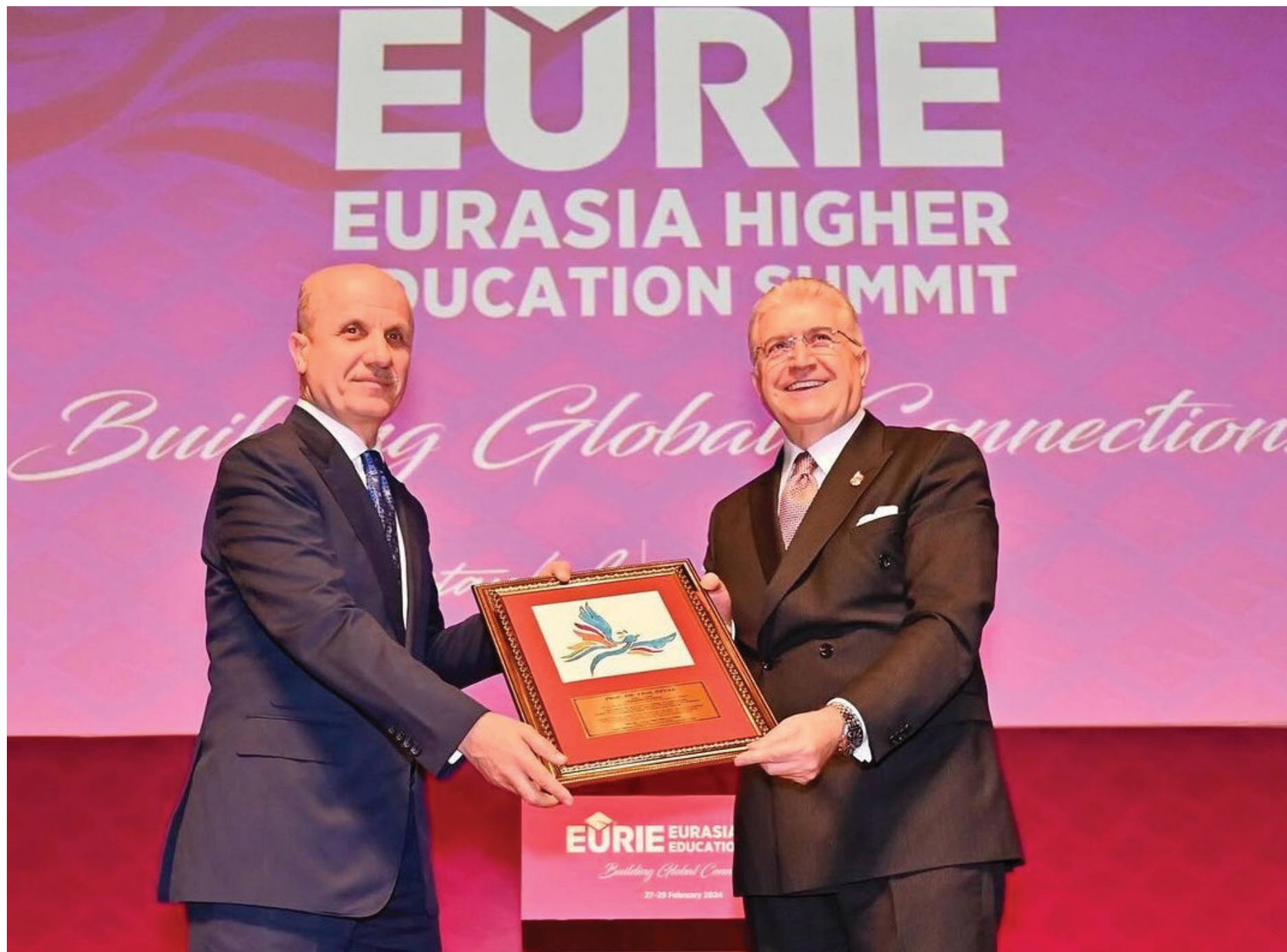
EURIE 2024 Opening Ceremony