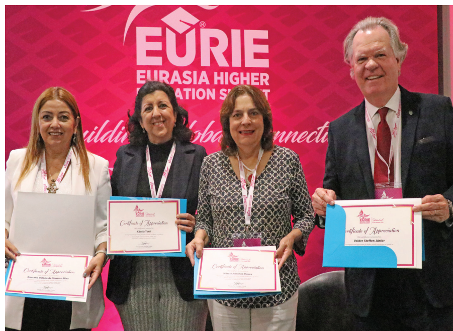
Panel: Higher Education and Internationalization in Brazil