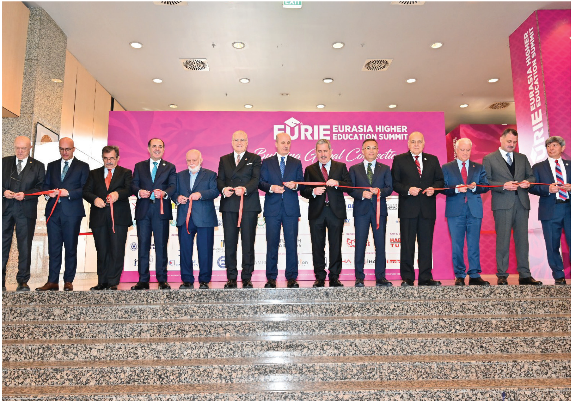
EURIE 2024 Opening Ceremony