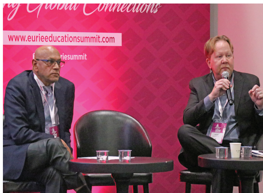
Panel: Post COVID Trends in Mobility and the University Experience - A U.S. Perspective