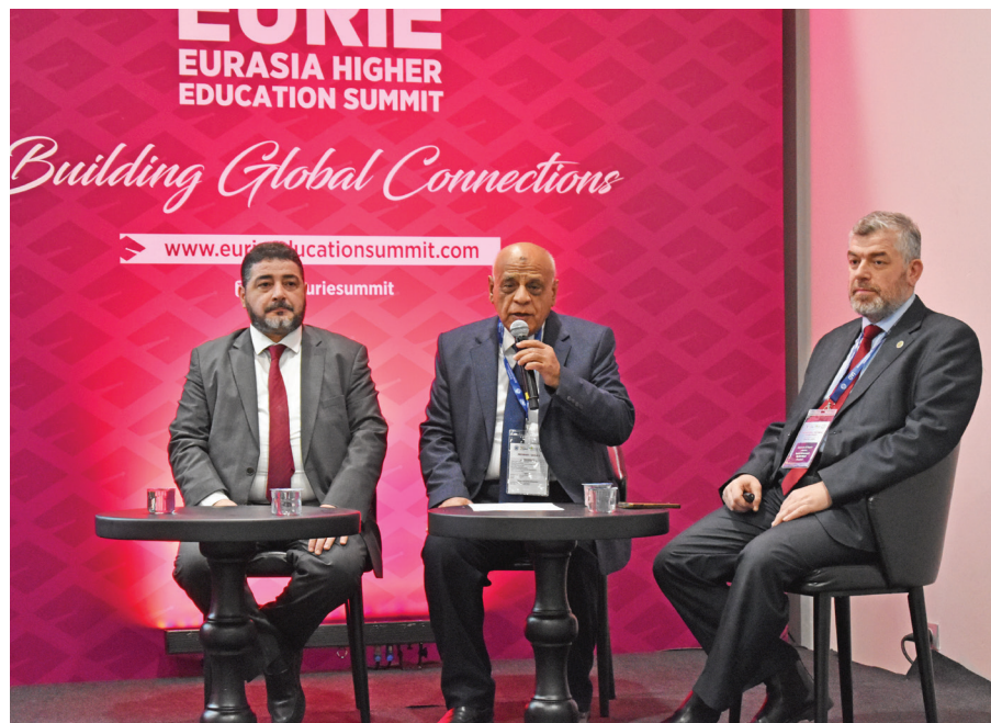
Panel: Internationalization of Higher Education in the Arab Countries