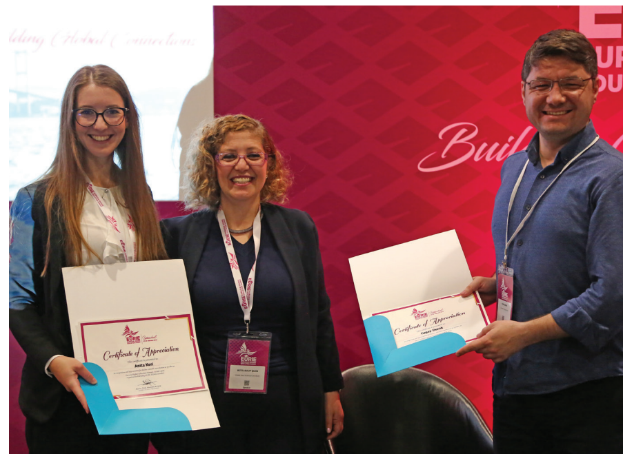
Panel: International Mobility Perceptions from Different Countries