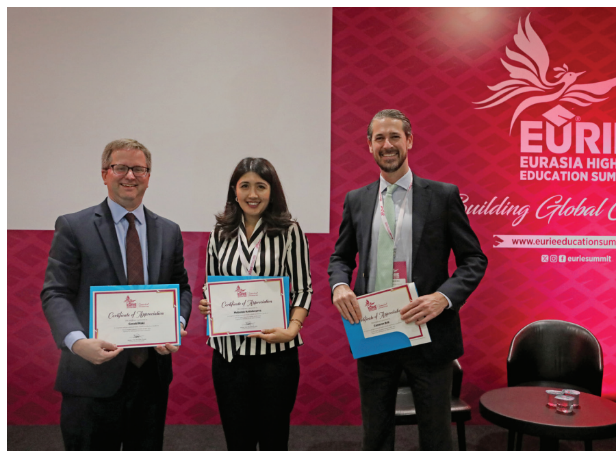
Panel: Virtual Exchanges