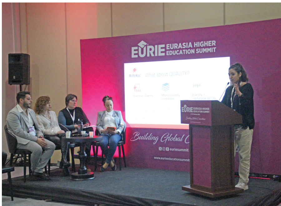
Panel: Multifaceted Dimensions of Refugee and International Student Integration in Higher Education