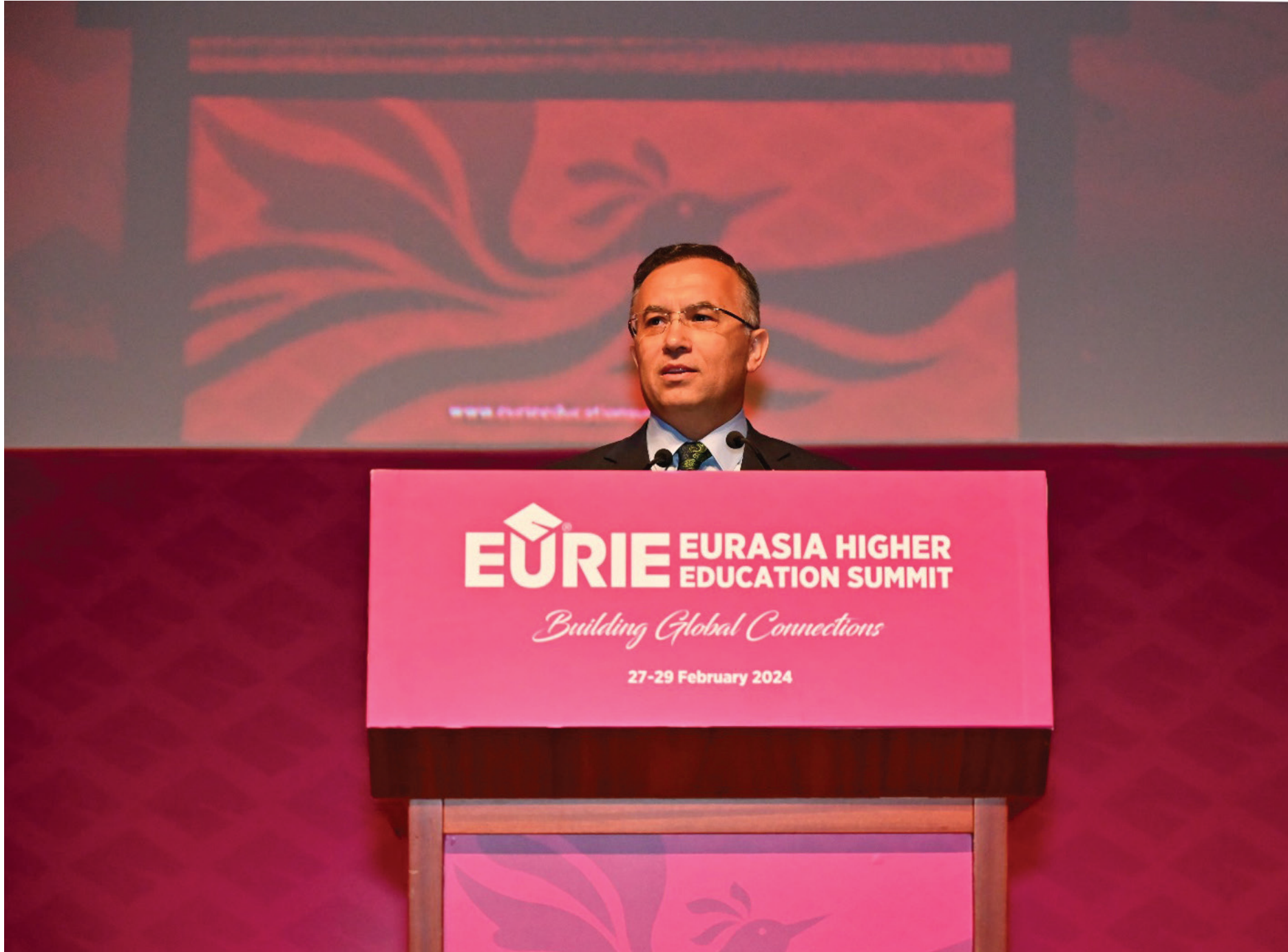
Kemal Çeber, The Governor of Gaziantep