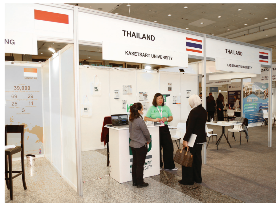
Meetings at the Exhibition Hall