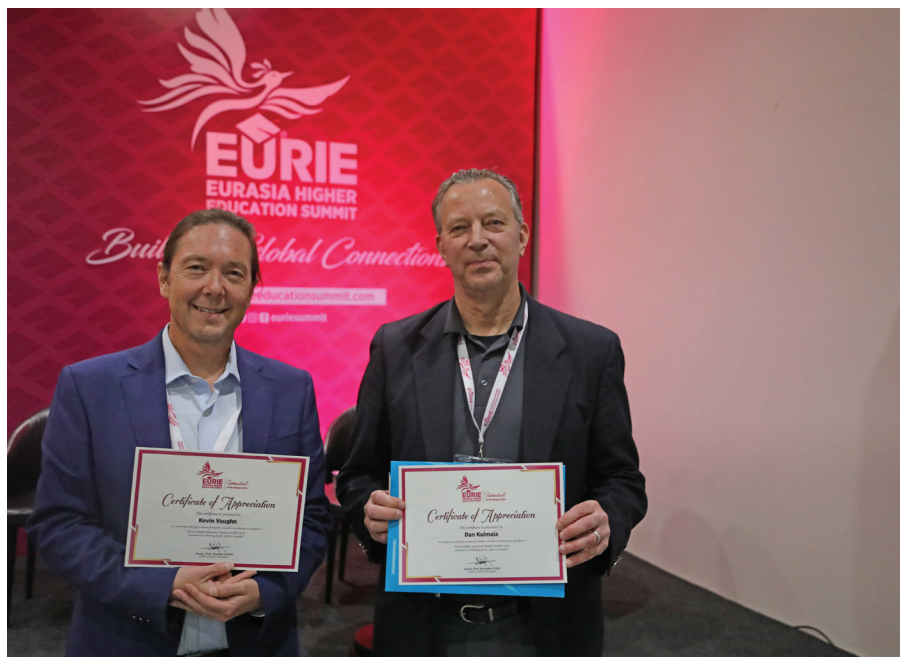
Panel: Embedding an Employability Framework into International Education: Case Studies in Applied Learning