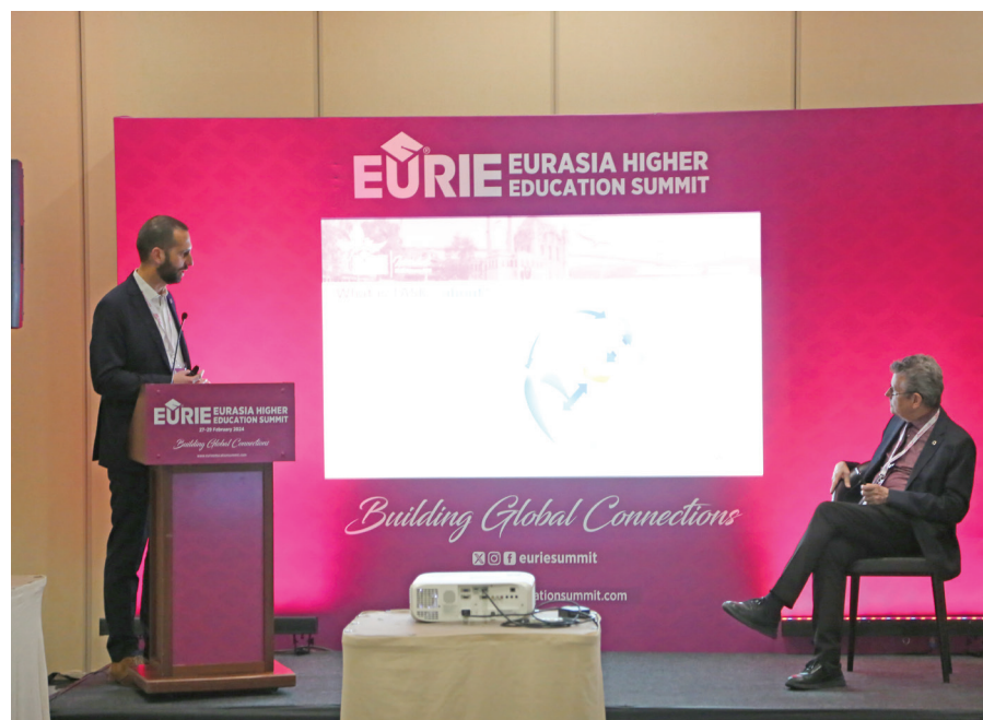
Workshop: Mainstreaming Sustainability Literacy in Eurasian Higher Education: Principles, Practices, and Assessment