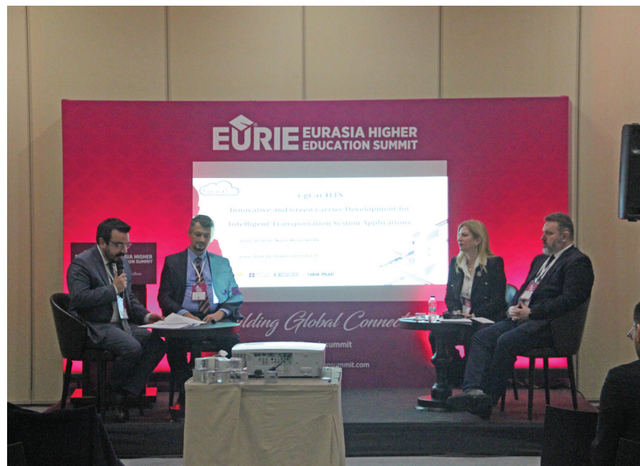
Panel: Unlocking Success: UK-Türkiye Institutional Partnerships