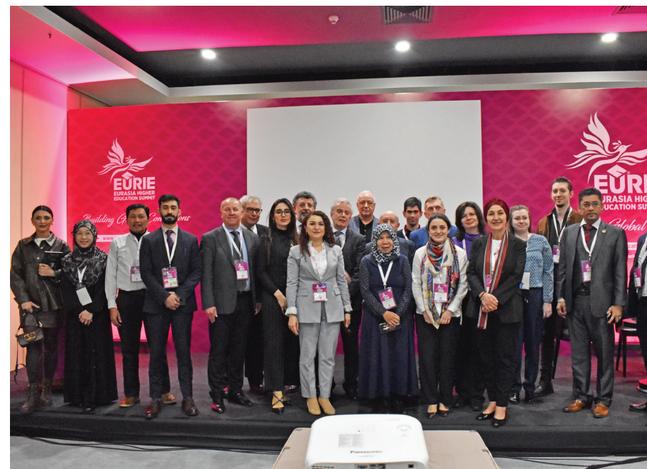
EURAS Members Forum