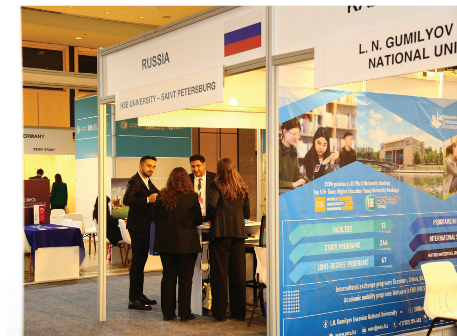
Meetings at the Exhibition Hall